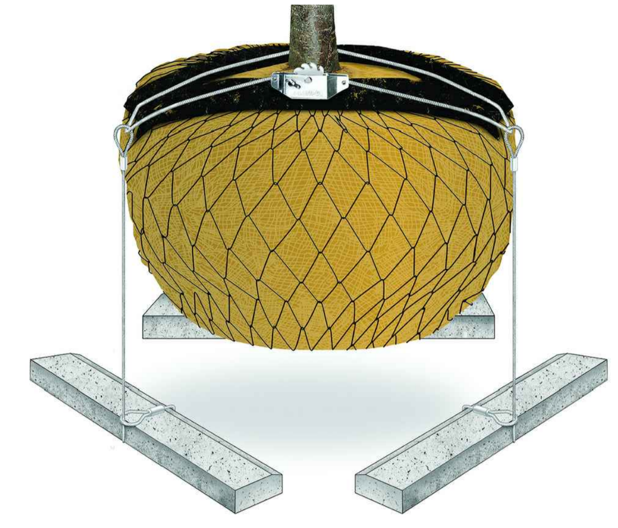
02 TREE ANCHOR SYSTEM