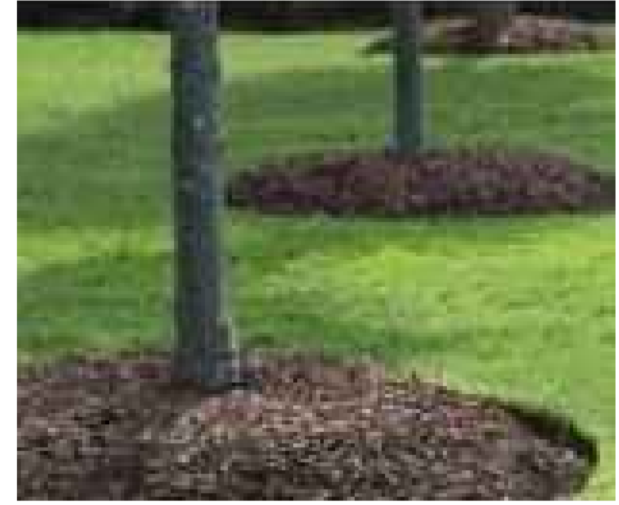
01 LAWN TREE PIT AND MULCH DETAIL